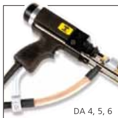
DA 4, 5, 6